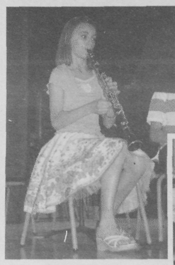
Roosevelt Students Entertain