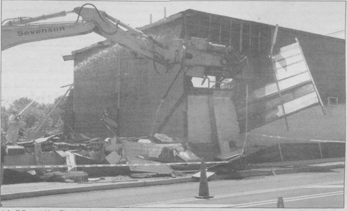
A building at Hamilton Boulevard and New Market Road was demolished Thursday as part of the remediation of the Cornell-Dublier Superfund site. Censors were installed around the perimeter to assess the air. No