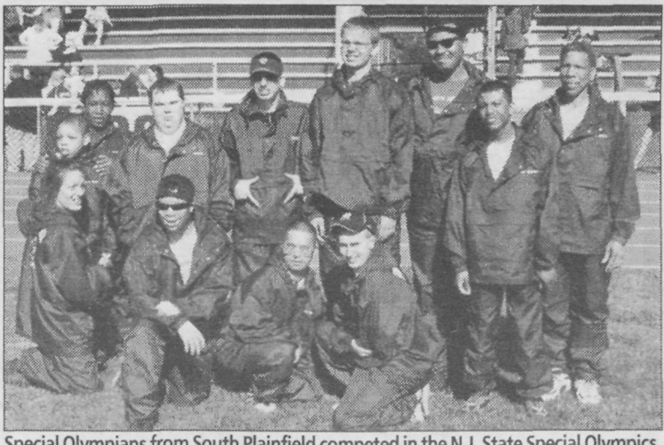
Special Olympians from South Plainfield competed in the N.J. State Special Olympics.

Unfortunately, the weekend began with dismal weather which led to the opening ceremonies moving indoors