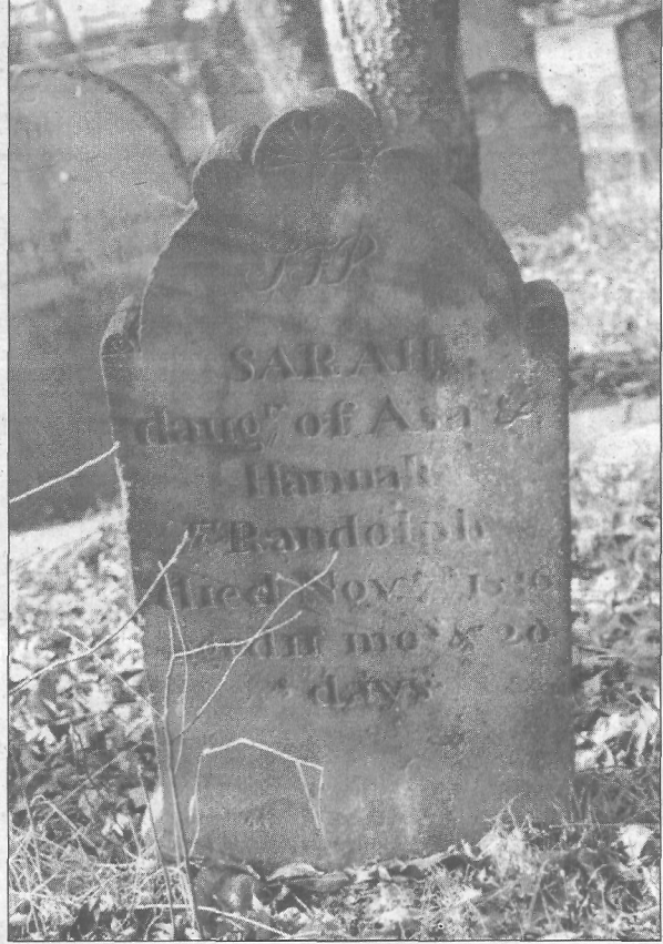
Headstone in historic Hillside Cemetery of Sampton on New Market Avenue reads: SRF, Sarah, daughter of Asa and Hannah Fitz Randolph, died Nov. 7, 1826, aged 11 months and 20 days.

The cemetery was initially used as a public burial ground. It was a last refuge for paupers and travelers passing through the are, when they died. Many of the graves were set off by simple wooden markers that eventually disintegrated. The oldest legible gravestone is that of Benjamin Hull, a judge who lived from 1693 to 1745. Among those at rest are: 39 veterans of the Revolutionary War; four from the Pennsylvania Insurrection of 1794 (Whiskey Rebellion); four from the War of 1812; 49 from the Civil