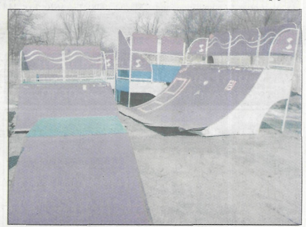
The dismantled skatepark equipment sits behind the borough garage until its fate is decided.

made regarding its future. On March 21 the park equipment (Continued on page 12)