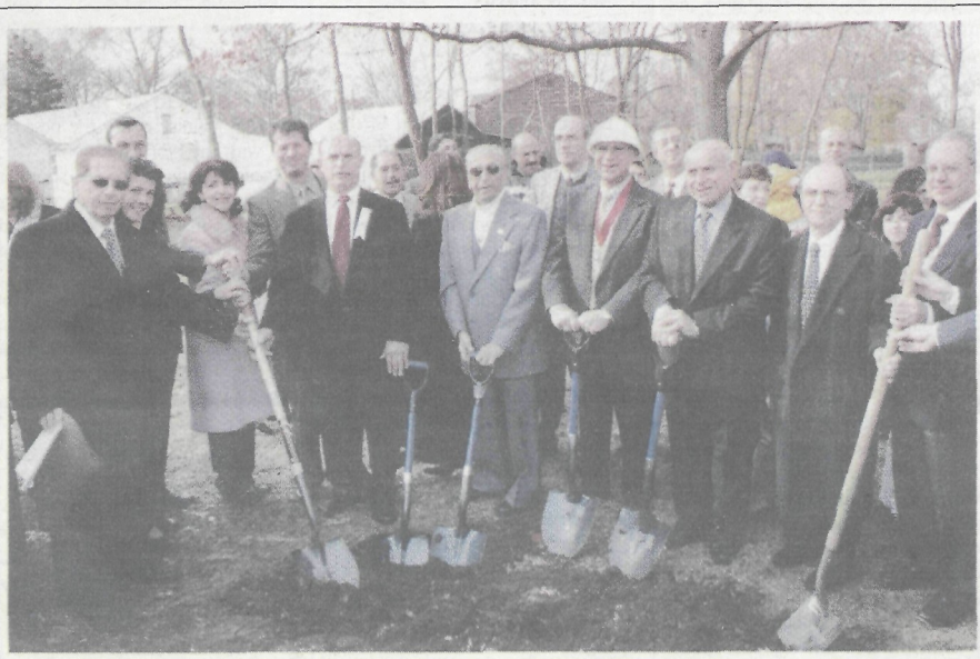
St. Stephen the Protomartyr Antiochian Orthodox Church held groundbreaking ceremonies for their new expansion project recently. (See story on page 3.)