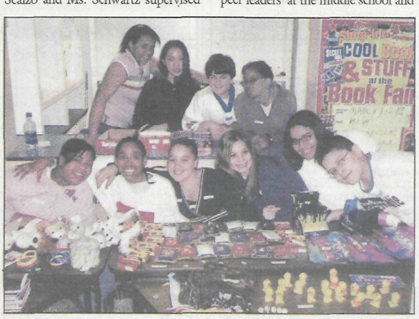
Middle School Peer-to-Peer and Student Alliance students organized a school supply sale to benefit St. Jude Children's Research Hospital.

hours of 1-3 p.m. and 5-7 p.m. At the end of the night, there were still supplies leftover, so the fundraiser continued into the following week during hunch periods. By the end of that week, the students had raised over $350 for St. Jude Children's Hospital. The money has already been sent to St. Jude's and each student who participated will receive a certificate from the hospital. The Peer Leaders should be very proud of their accomplishments.