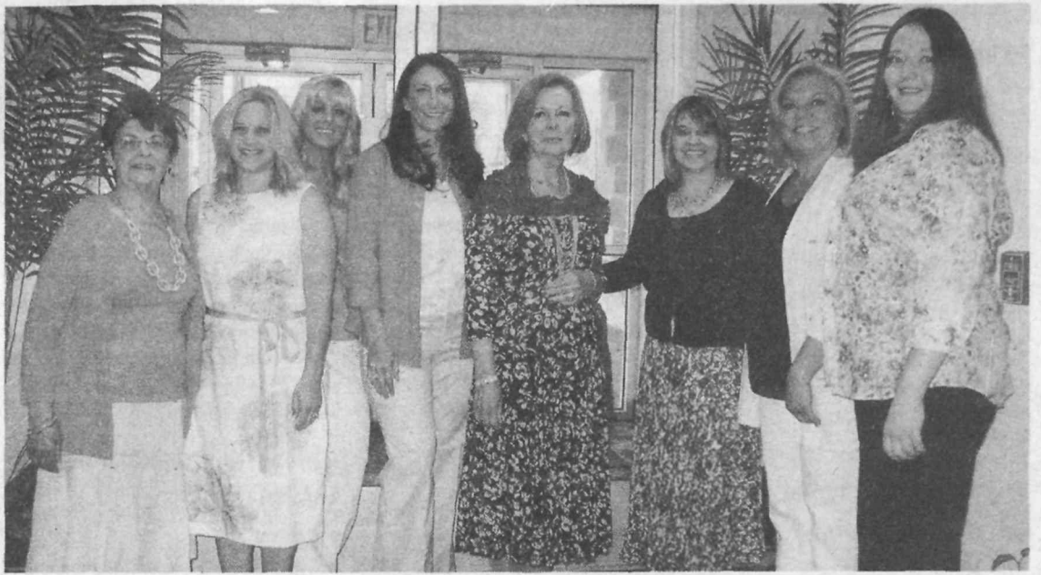
Suburban Woman's Club Fashion Show featured club members as models. Along with a few members, three members' granddaughters, one member's daughter and one prospective member assemble prior to going on stage.