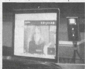
Gloria Steinem "Skypes" with high school students.