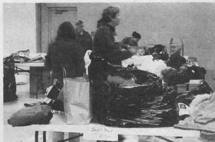
Volunteers separate food and clothing at the Senior Center to donate to the survivors of the fire that took place last week on Clinton Avenue. (See page 5 for information on donating.)

The following is a fire safety checklist to lower the chances that a fire may start in your home: Keep the furnace in working order; use a fireplace screen; have proper ventilation for heaters and other small appliances; do not smoke in bed; use the correct size fuses; don't use worn out electrical wiring or run it under rugs or out windows or doors; clear refuse away—the less clutter, the less fuel a fire has to feed on.