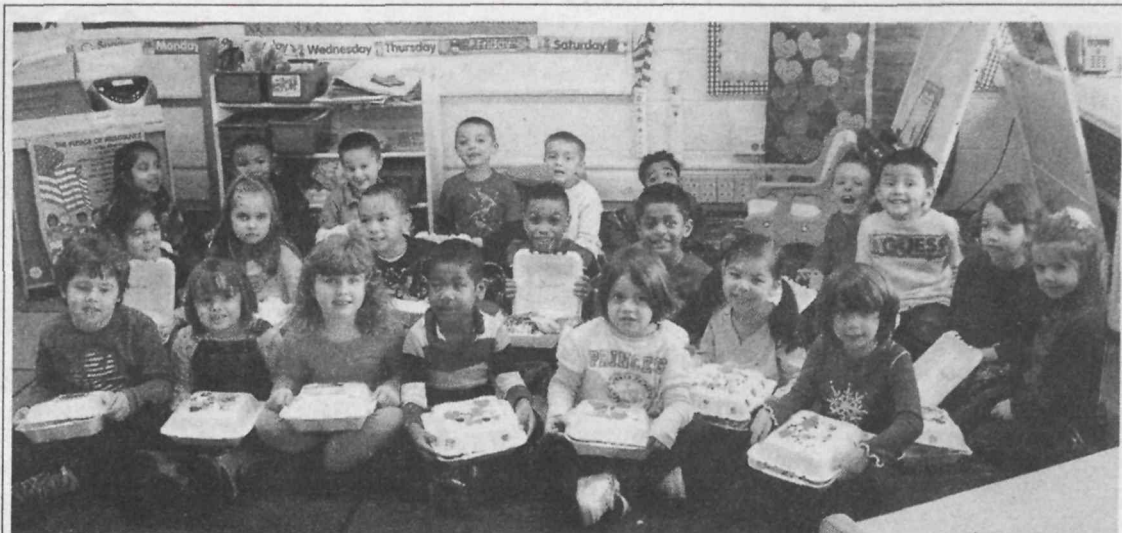
The Future Stars Red Room want to send a big "thank you" to Hometown Heros which donated containers for the children to decorate for Valentine's Day. The Future Stars send a big hug and kiss too, and wish everyone a very happy Valentine's Day.

The grant is worth $1,000, and if the veteran returns for a second year of education, the grant will also be given for that year. The grant and 2012 scholarship applications for high school seniors are available at the post lounge daily after 2 p.m. Deadline for completing applications is May 1.