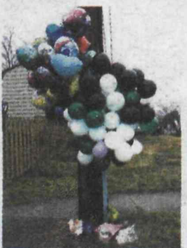
A memorial of flowers and balloons at the curb in front of the home where five victims died.