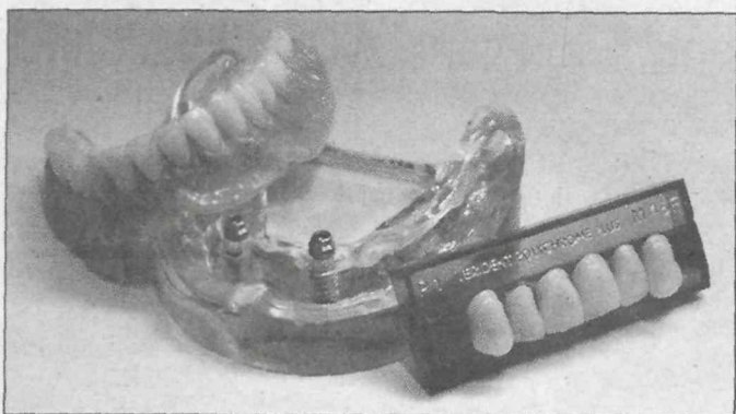
Specialty permits # 3085 and #2107

Over 2,500 Successful Surgeries By Specialists With Over 65 Years Combined Experience