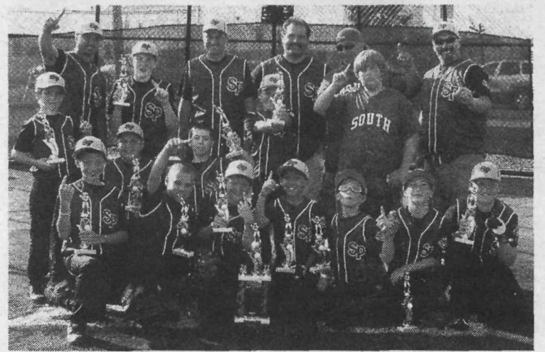
The 11U All Star team with their first place trophy and their individual trophies.