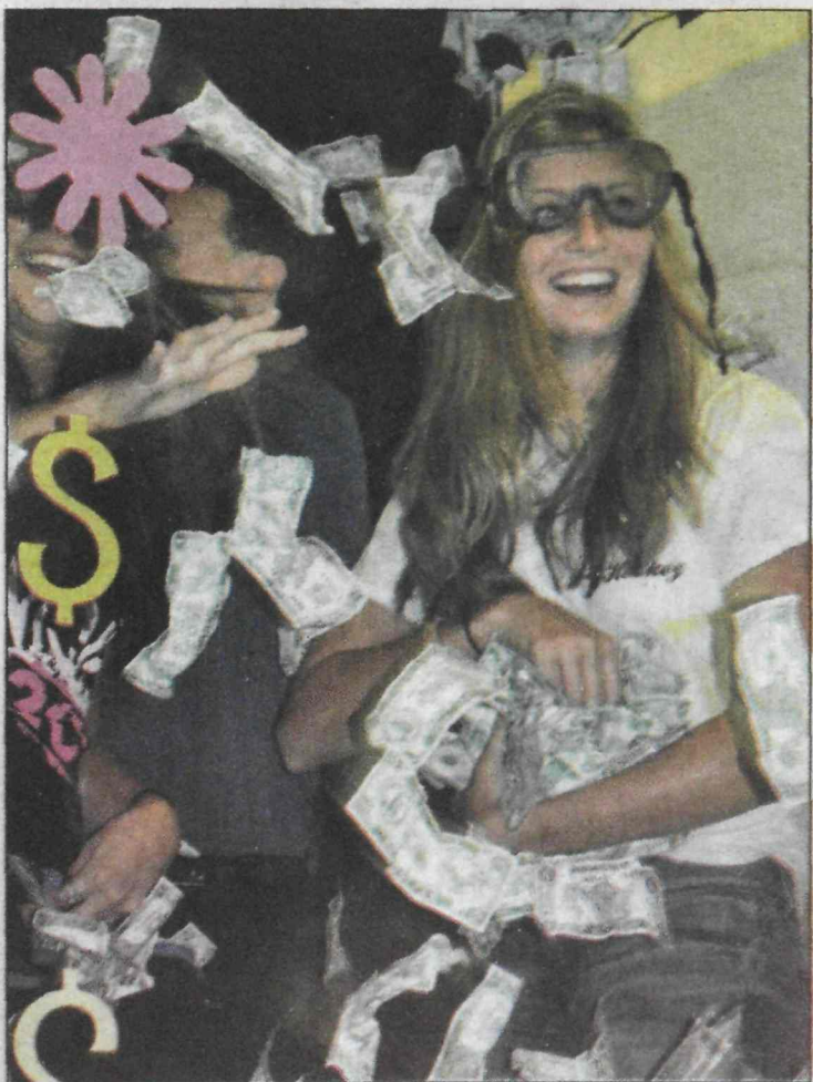
A SPHS graduate enjoys the "money booth" at Project Graduation.