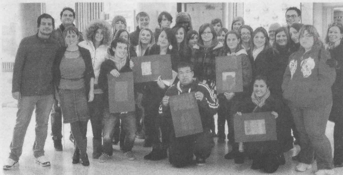
Students and teachers from South Plainfield High School Spanish and art classes at El Museo del Barrio.

The Learning for Life program is held in the facilities of the United Presbyterian Church, 525 Front St. in Plainfield. Use the office entrance, last door to the left when facing the church complex from the rear parking lot.