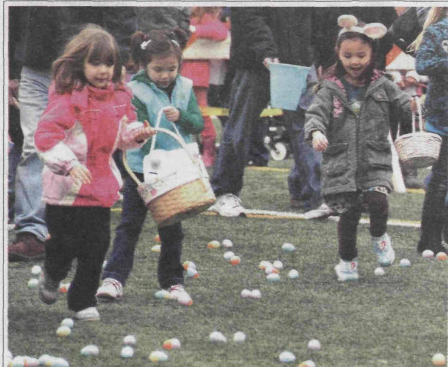
Eager youngsters take off to gather eggs at the recreation-sponsored annual Easter egg hunt last Friday. Hundreds of children participated in the event that had been postponed due to rain. See page 12 for additional photos.