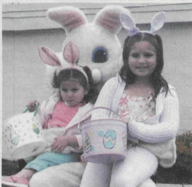
The Recreation Department annual Easter egg hunt, which was postponed due to inclement weather, was held last Friday. Hundreds of children, along with their parents, showed up for the event. There were plenty of eggs for each child who participated. They all received a special gift, a stuffed bunny, in addition to all of the eggs they collected. The Easter Bunny was present, which was evident by the long line of children waiting to speak to him.